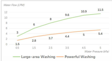
Flow Rate Table

EXPERTISE IN STAINLESS STEEL BESTWARE ONE-STOP SOLUTION PROVIDER OF STAINLESS COMMERCIAL FAUCETS